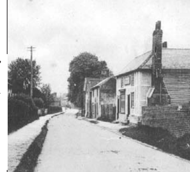
McMullen’s Off-Licence, High Street north

“We used to meet at the mill in the evening and play knock-down-ginger, especially on dark evenings, until the local policeman caught us”