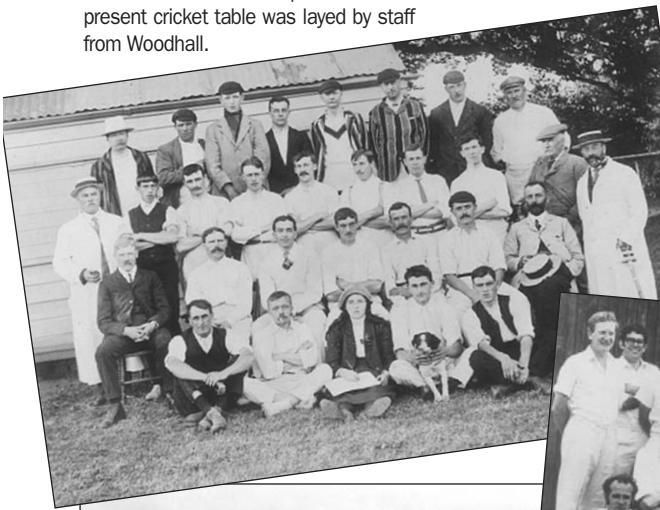
Bottom: Another fine innings for our team