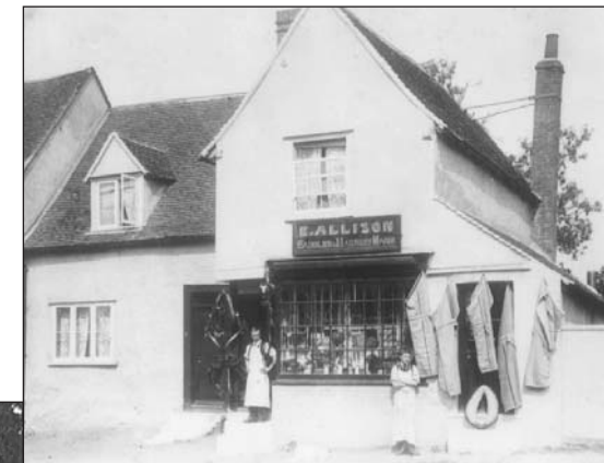
Above: Allison's Saddlery, now occupied by Sandy's

Where does one stop when writing about villages and the people who live in them? If you or your family have been missed out of this short history of the village, don't despair, there will be others.