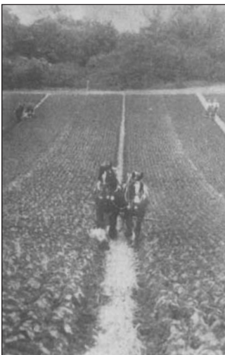
Estate workers cottages, above, and the ploughing matches which took place annually, right

A chicken factory was started at the old mill, in Mill Lane, some years before it was burnt down in 1967. The oil companies had a storage depot in the old station yard until 1993. A fish curing factory was situated on what is now the site of Newmans Court.