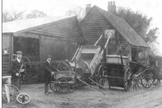
The Wheelwright and Undertaker’s

If we turn to the south of the High Street, we find Watton Cottage (below), a house known to most of the older people in the village as the Doctor’s House. One